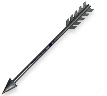
Start Archery arrow pen £2

A wide variety of Archery GB shop items will be sold at the information desk in the foyer. Here is a selection of some of the many products we have: