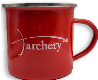
Enamel mug £8