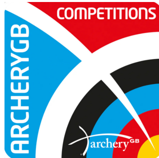
Competitions sticker £1.50