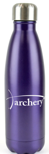
Water bottle £15