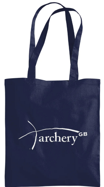
Tote bag £7.50