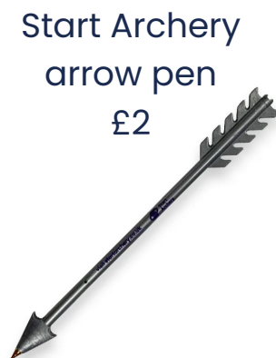
Start Archery arrow pen £2