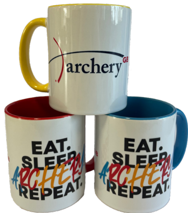
Novelty mug £8

A wide variety of Archery GB shop items will be sold at the information desk in the foyer, including our new fidget range and GB team badge. Here is a selection of some of the many products we have: