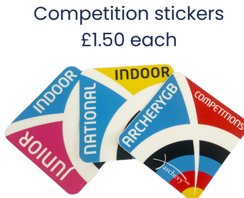
Competition stickers £1.50 each