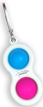
Fidget popper £4.50