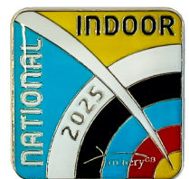
Indoor badges £4 each