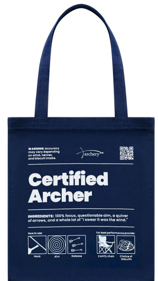
Tote bag £8.50